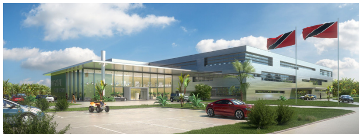
Hospital Point Fortin, Trinidad