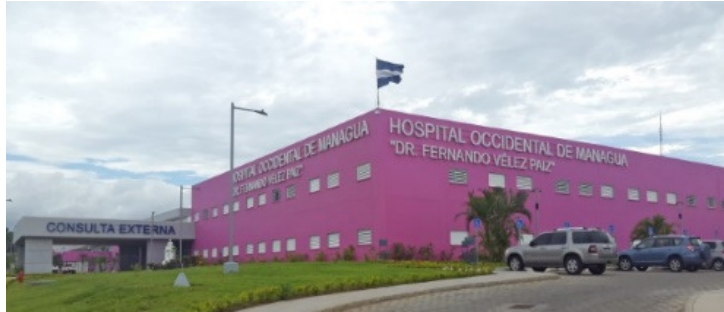
Hospital Occidental, Nicaragua