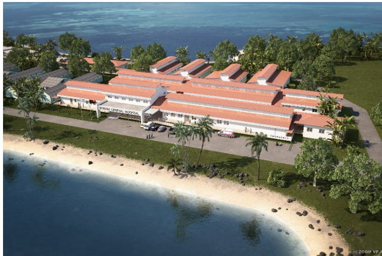
General Hospital – Wewak Papua New Guinea