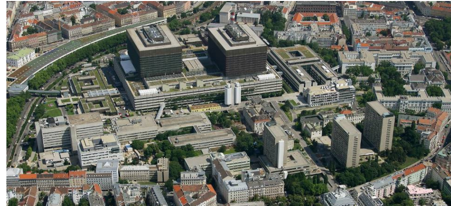
General Hospital – University Clinics, Vienna