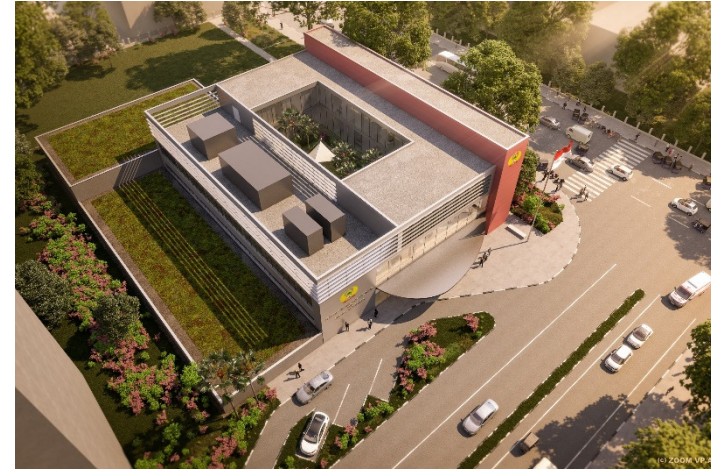
Center for Nuclear Medicine and Radiation Therapy Indonesia