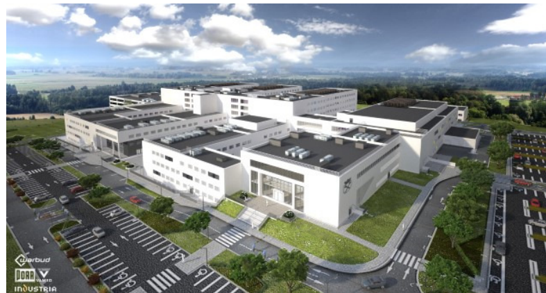
Hospital, Krakow Poland