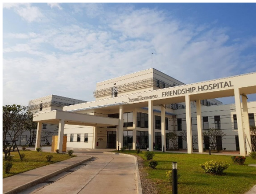
Laos IV: Friendship Hospital Laos