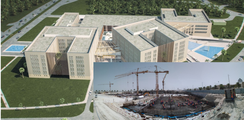
Al Reem Hospital, Abu Dhabi, UAE