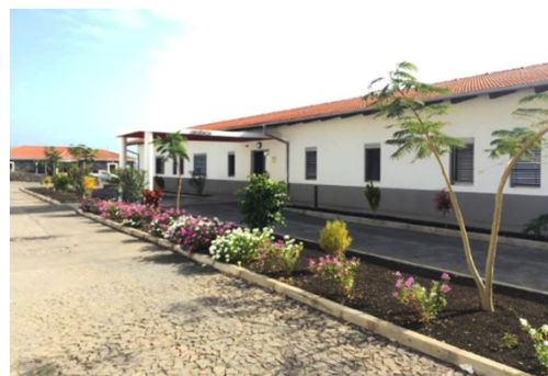
General Hospital Fogo, Cap Verde