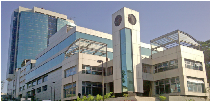
San Fernando General Hospital, Trinidad