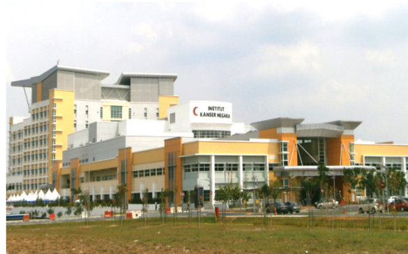
National Cancer Centre - Putra Jaya Malaysia