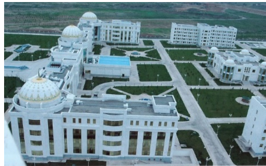
Turkmen state medical university, Ashgabad – Turkmenistan