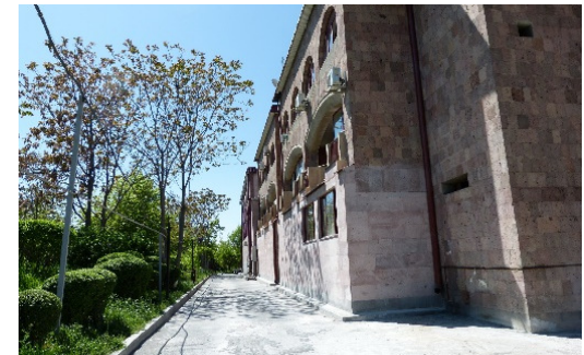
Nork Marash medical centre, Yerevan- Armenia