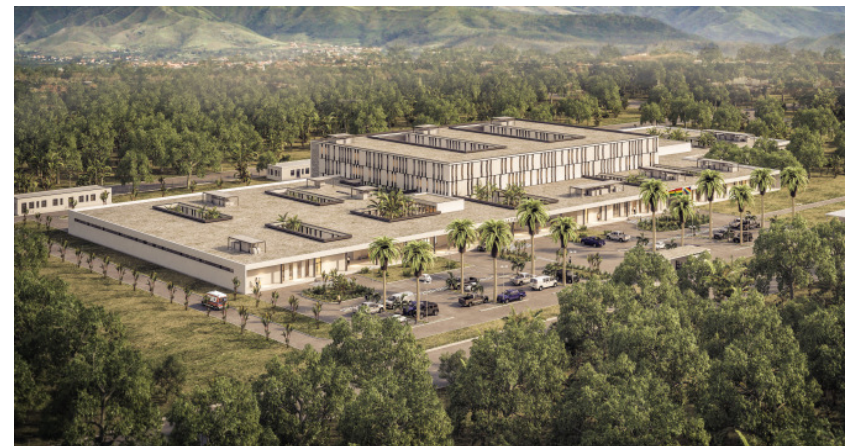
Hospital Villa Tunari, Bolivia