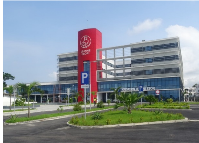
University Hospital Jeanne Ebori, Gabon