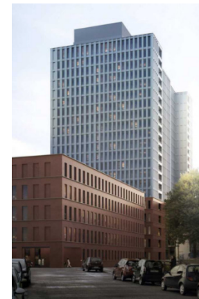
Charité, Berlin Germany