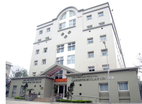
Hue Central Hospital Vietnam