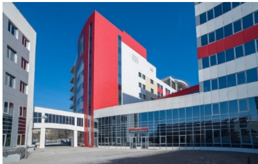
General hospital no. 4, Sochi (Olympic hospital) – Russian Federation