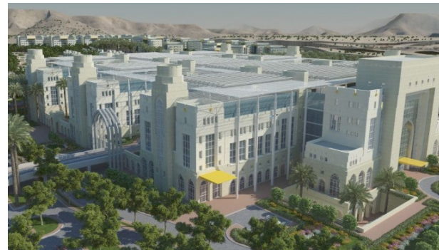
Royal Oman Police Hospital, Muscat, Oman