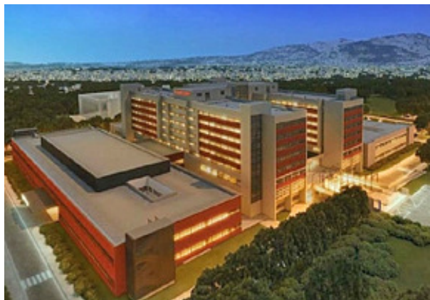
University Clinics – Banja Luka, Bosnia and Herzegovina