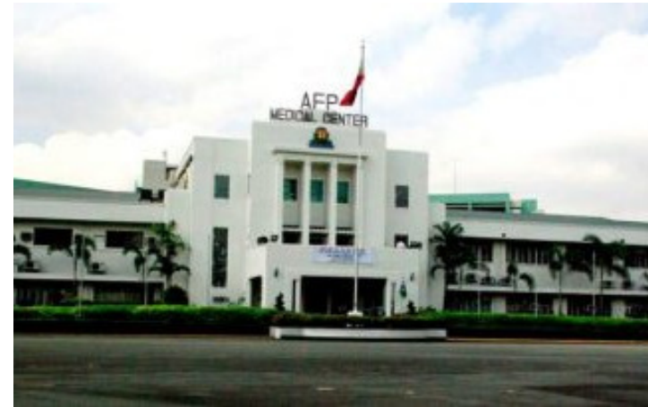
AFP Medical Center Philippines