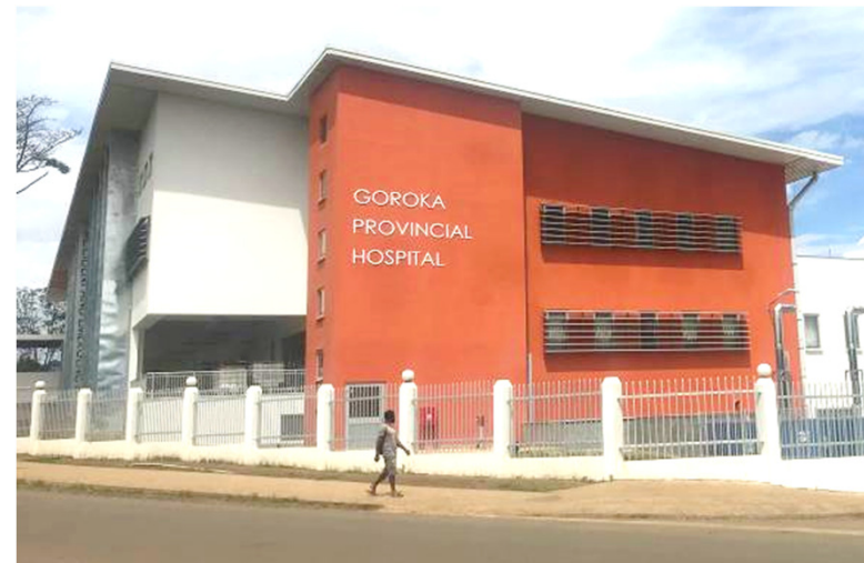
General Hospital – Goroka Papua New Guinea