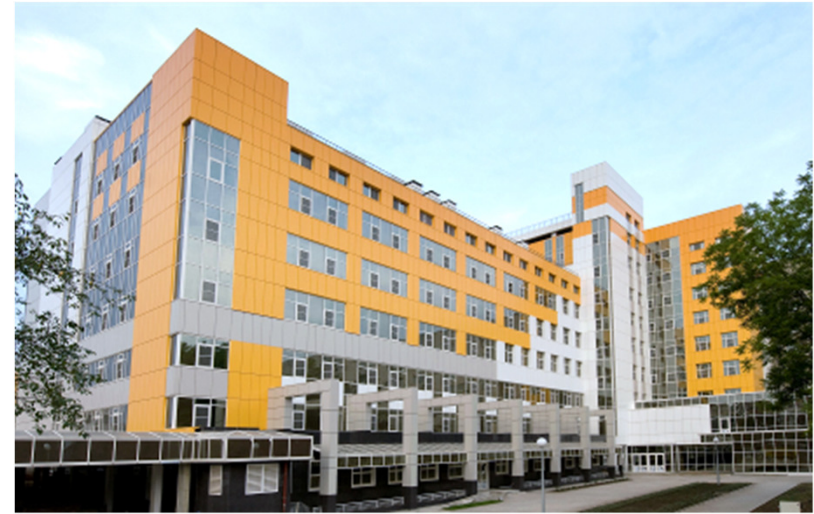
Krasnodar regional hospital no 1 Ochapovsky - Russian Federation