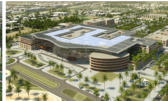
Al Ain Hospital, Al Jimi, UAE