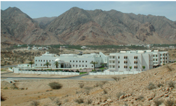
Private Hospital, Muscat, Oman