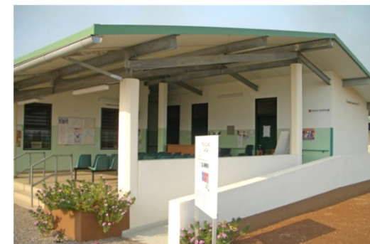
Polyclinic Janga, Ghana