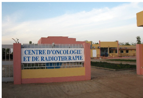
Radiotherapy Center Bamako, Mali