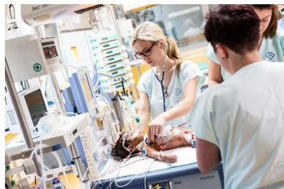
Paediatric heart surgery