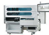
cobas p 680 Instrument