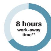
cobas® 6800 System