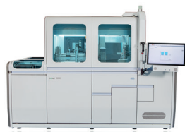
cobas® 6800 System