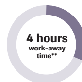
cobas® 8800 System