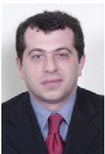
Mr. Armen Sargsyan